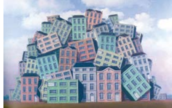
René Magritte La Poitrine , 1961 huile sur toile, 90 x 110 cm